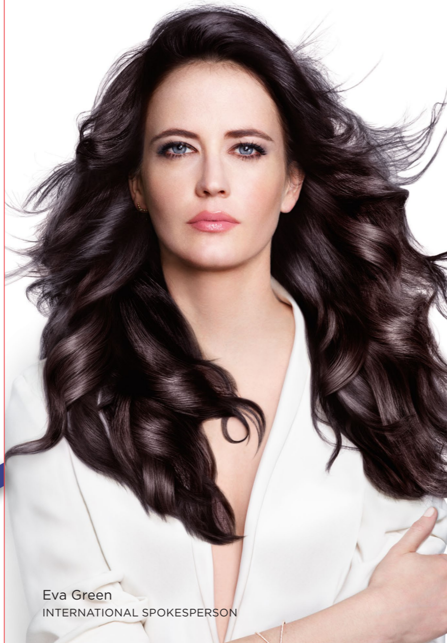
Eva Green INTERNATIONAL SPOKESPERSON

RECONSTRUCT ▶ Very Damaged Hair Frequently Colored / Permed / Straightened Hair